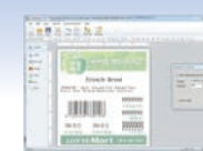
View images in advance