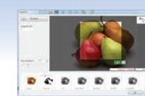
Image editing function