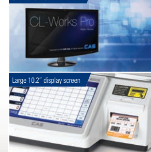
Large 10.2" display screen